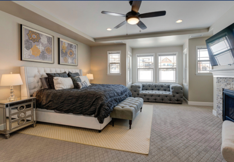
Square footage is approximate and to be verified by Buyer. The information contained herein has been obtained through sources deemed reliable but cannot be guaranteed as to its accuracy. Any information of special interest should be obtained through independent verification. Pricing, inclusions, exclusions and property information is subject to change, without notice. Call Listing Agent for more information.